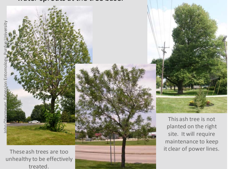
Contact your city forester about local ordinances before performing any tree work!