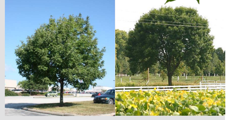
These ash trees are healthy, have all of their leaves, and provide benefits to the landscape. They would be good treatment candidates.

Showing only few outward signs of EAB infestation.